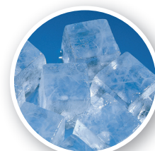
IM-130ANE-HC-23 Ice: Cube (M) Size: Approx. 28 x 28 x 23mm