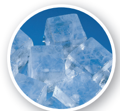
IM-100NE-HC-23 Ice: Cube (M) Size: Approx. 28 x 28 x 23mm